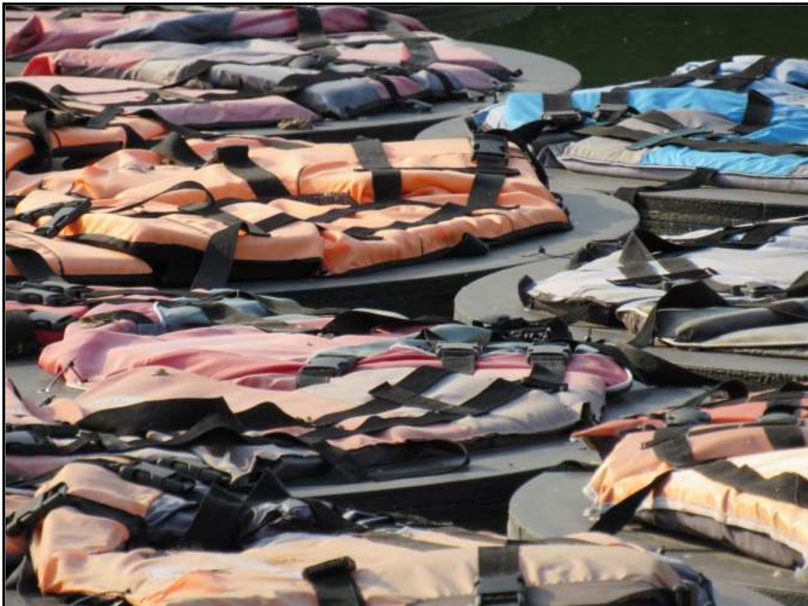
FIGURE 5b: Ai Weiwei, F Lotus , installation, Belvedere Museum, Vienna, Austria, 2016. (Close-up of 1 005 worn life jackets into the shape of lotus flowers in the pond.)