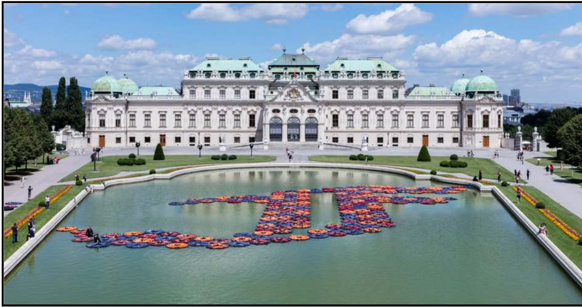
FIGURE 5a: Ai Weiwei, F Lotus , installation, Belvedere Museum, Vienna, Austria, 2016.