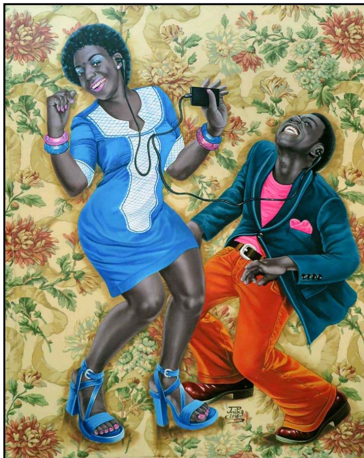
FIGURE 1b: JP Mika, La Belle Ambiance , acrylic on fabric, 2016.