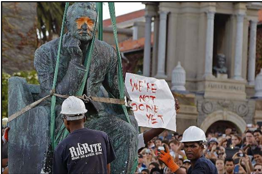
FIGURE 8b: The removal of the Cecil John Rhodes statue, University of Cape Town, 2015.