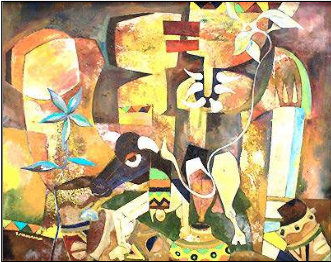
FIGURE 2a: Speelman Mahlangu, Ubuntu Spirit of African Solidarity , oil on canvas, date unknown.