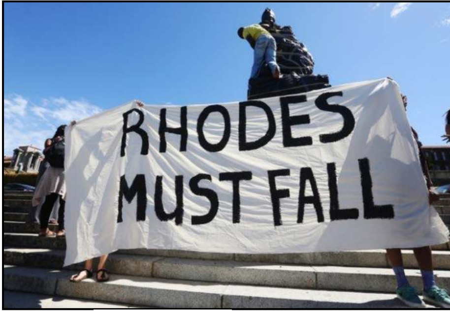
FIGURE 8a: Photograph of the Cecil John Rhodes statue , made from bronze and erected in 1934, being removed from the campus of the University of Cape Town.