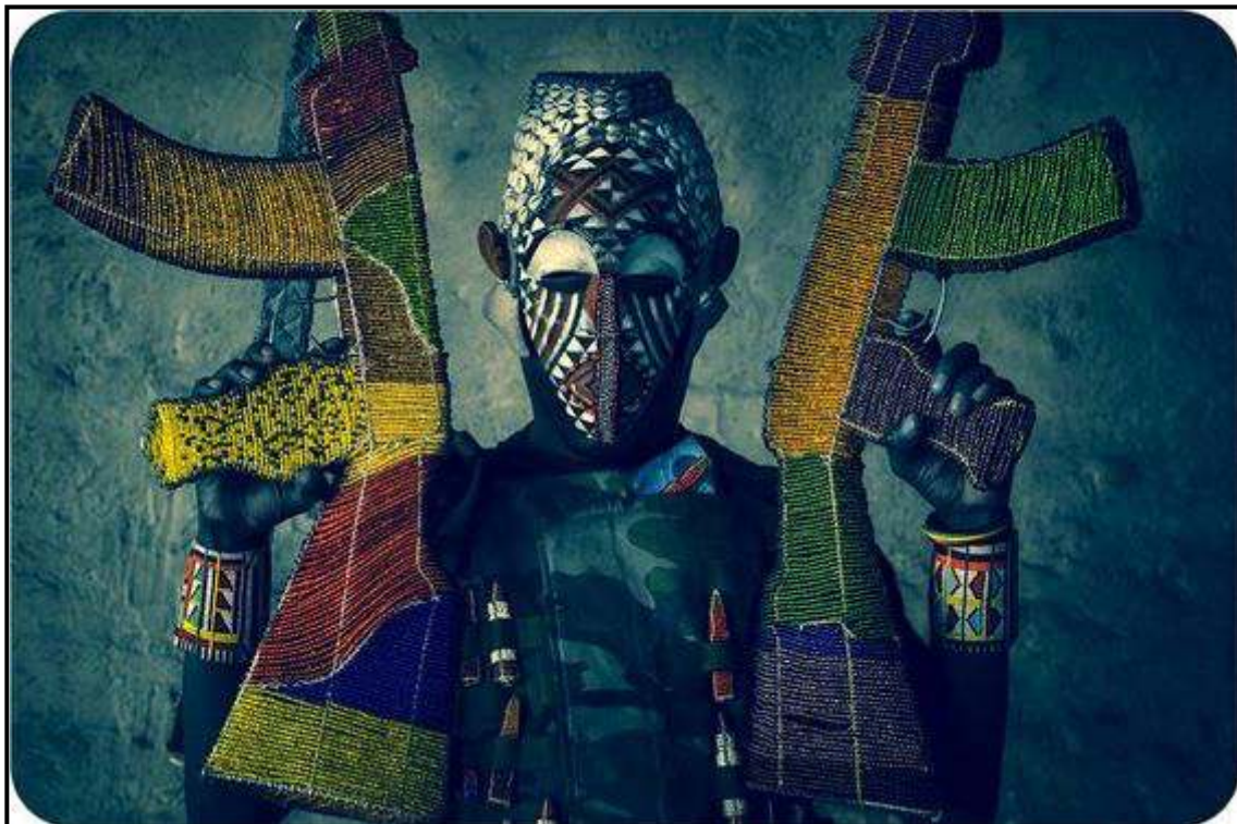
FIGURE 2b: Ralph Ziman, Hondo 'War' (Shona) MUTI Gallery, digital print on Moab Entrada paper, 2013.