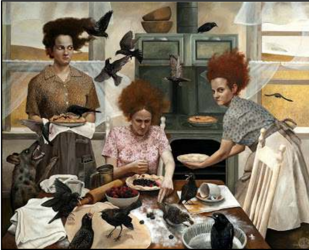
FIGURE 7a: Andrea Kowch, The Visitors , acrylic on canvas, 2010.