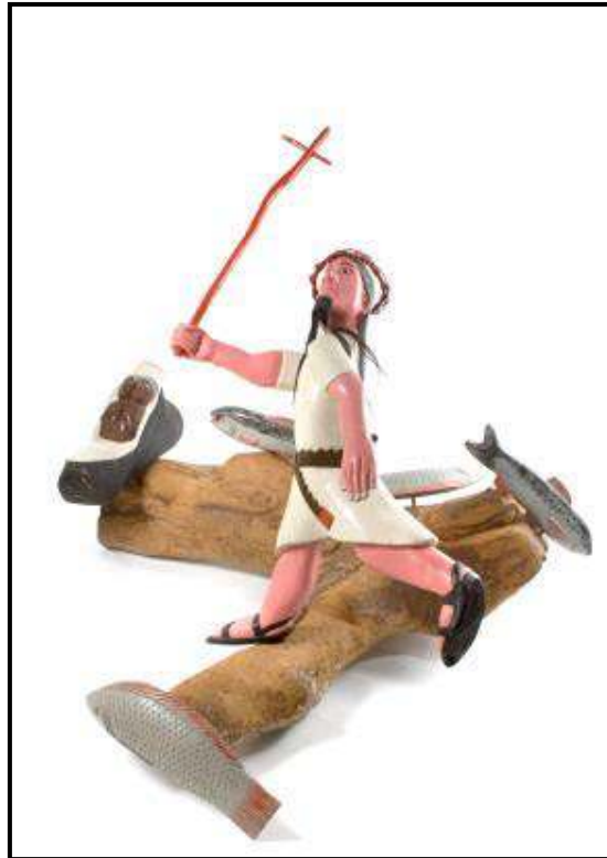
FIGURE 4a: Johannes Maswanganyi, Jesus is Walking on the Water , wood, paint, barbed wire, animal hair, 1994.