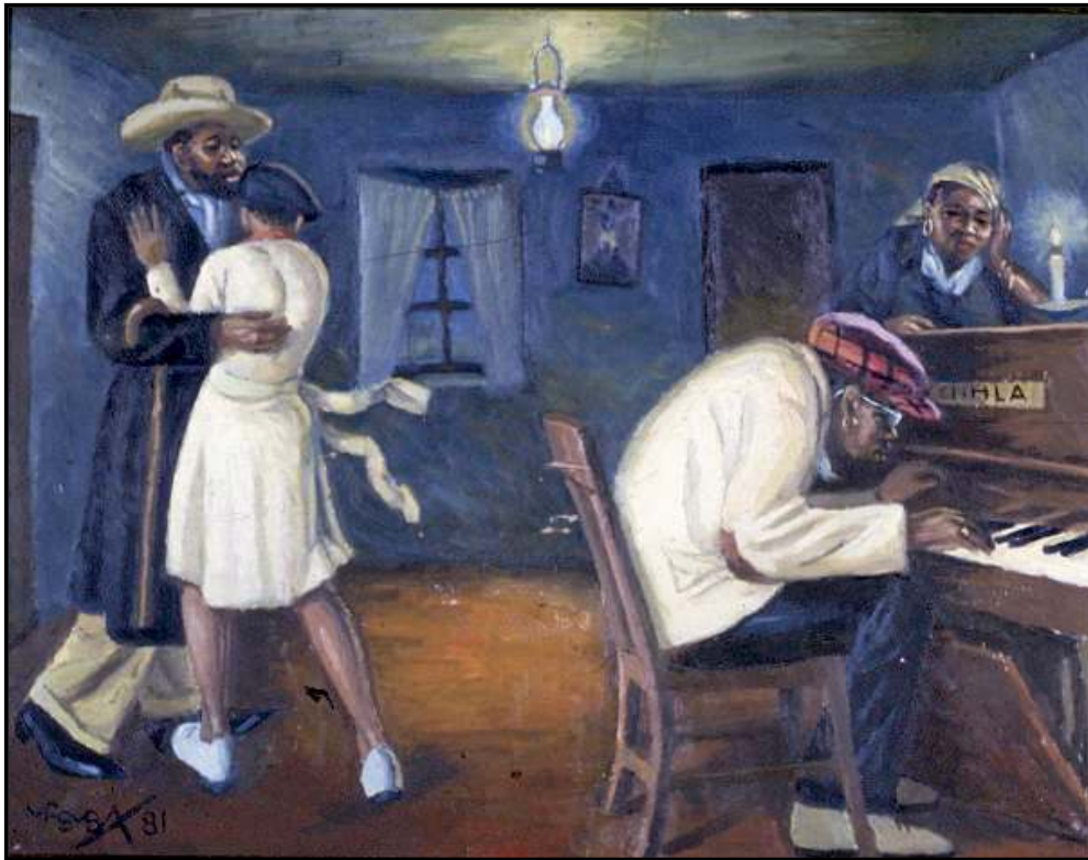
FIGURE 1a: George Pemba, Kwa Stemele , oil on cardboard, 1981.