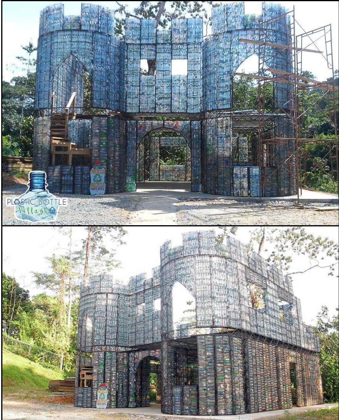
FIGURE L: Plastic village house by Isla Colon (Panama), 2016.

Effective sustainable design solutions comply with the principles of social, economic and ecological sustainability.