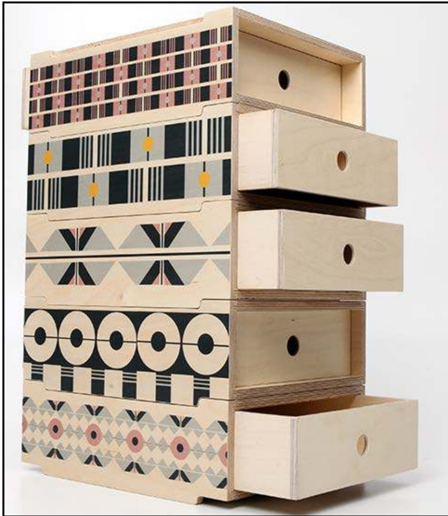
FIGURE A: Chest of drawers by Renée Rossouw and Deanne Viljoen, De Steyl Studio (South Africa), 2015.

1.1.1 Analyse and discuss the use of the following elements and principles of design in relation to FIGURE A: