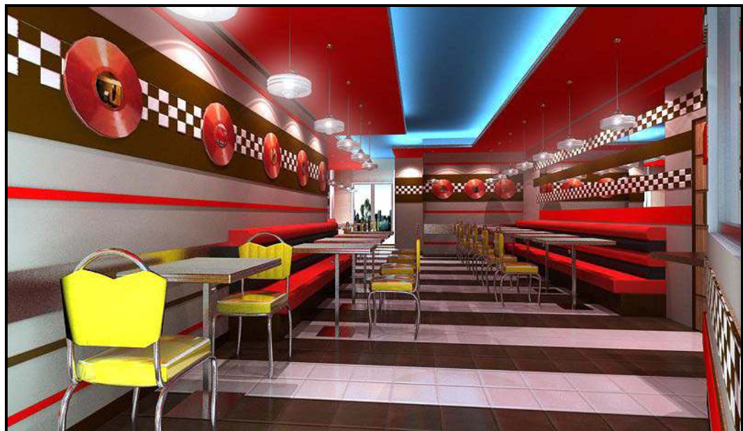
FIGURE E: Proposed restaurant by Kylie Shamini (Turkey), 2016.

In an essay (at least ONE page) compare the interior design of FIGURE D with that of FIGURE E above.