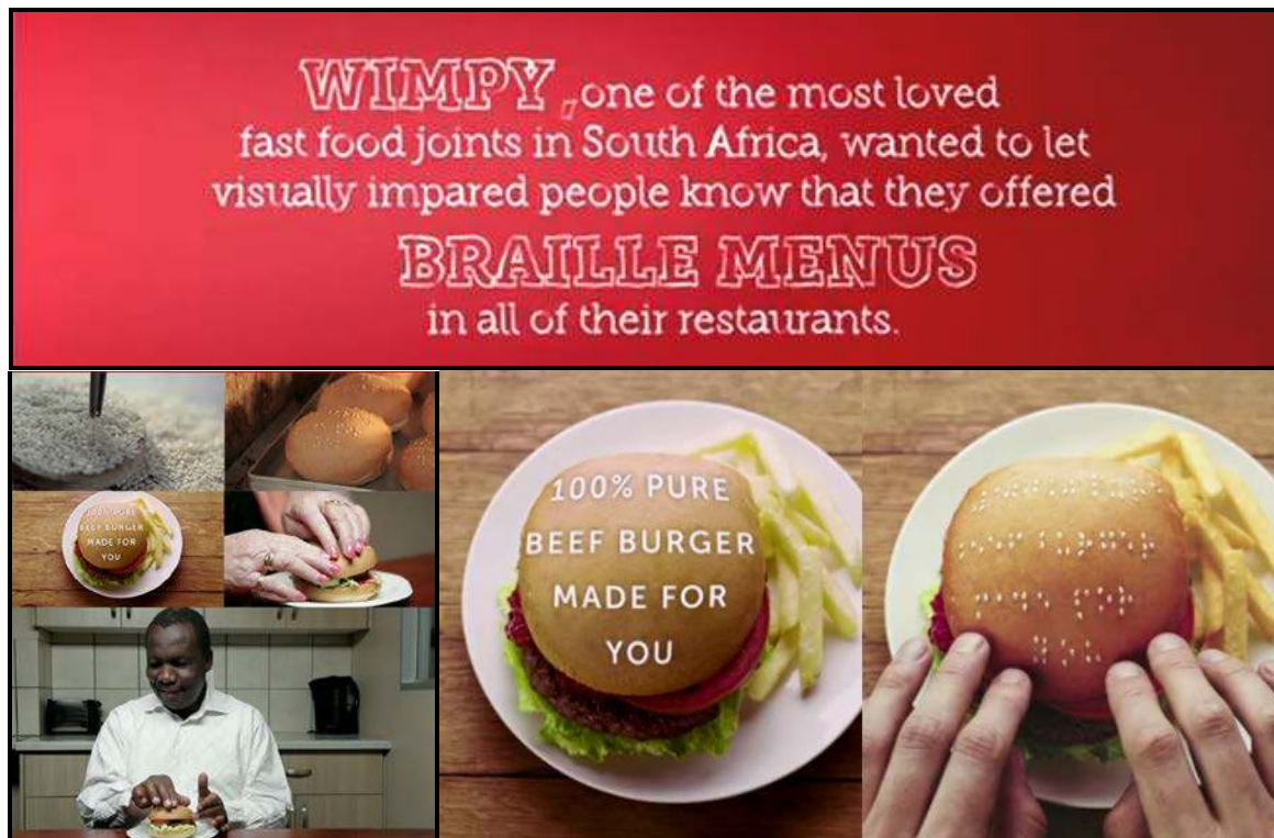
FIGURE J: The Wimpy Braille Campaign by Metropolitan Republic (South Africa), 2016.