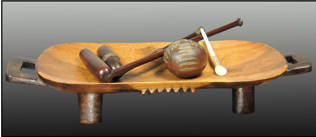
FIGURE K: Traditional Nguni products (South Africa), 1985.

5.2.1 Do you think the traditional products in FIGURE K are still useful today? Give reasons for your answer. (2)