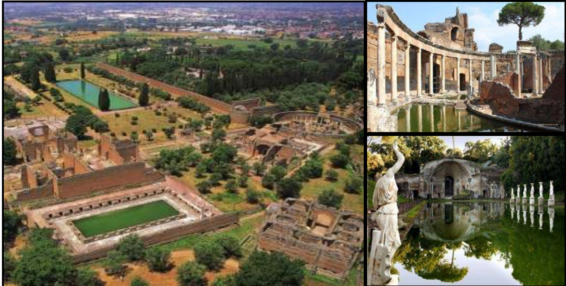
FIGURE F: Hadrian's Villa , architect unknown (Tivoli, Italy), 2 nd century BCE.