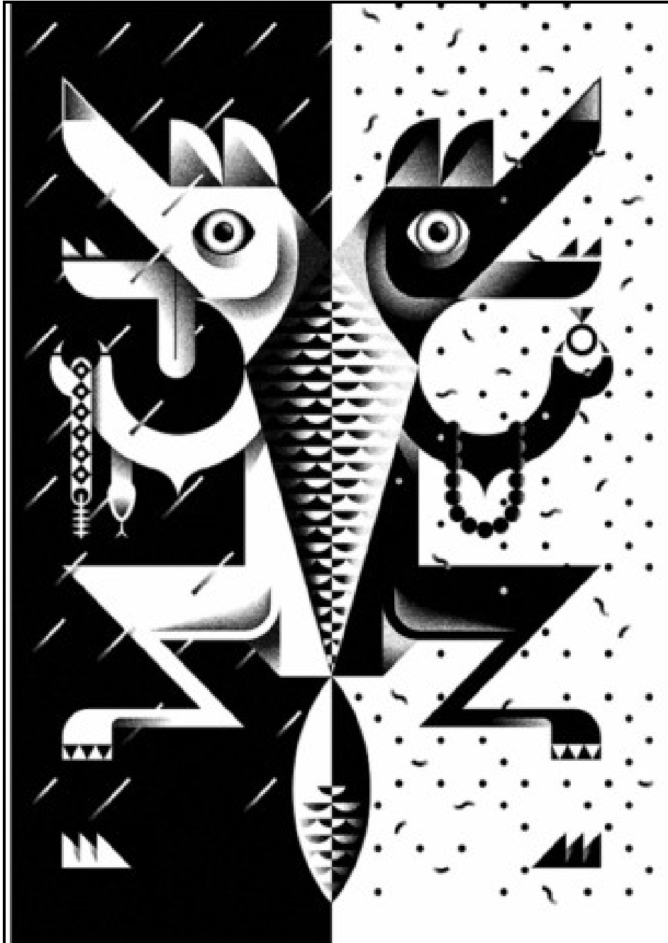
FIGURE B: How the Birds Chose a King (design illustration) by Jono Garrett (Johannesburg), 2015.

1.2.1 Analyse and discuss the use of the following in relation to FIGURE B: