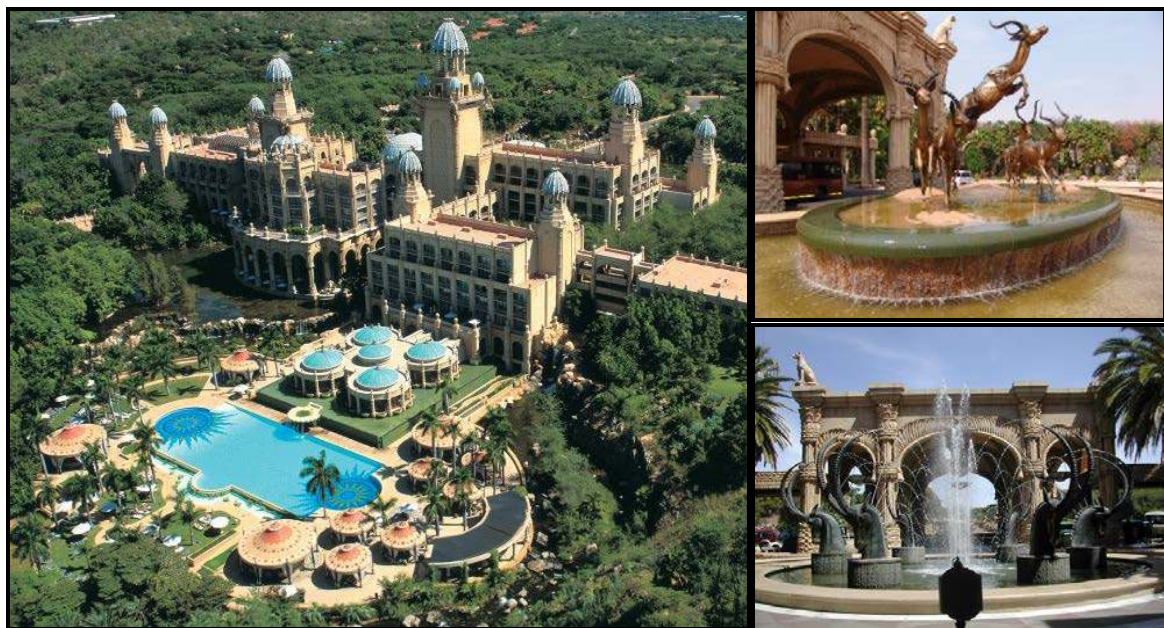
FIGURE G: Palace of the Lost City by WATG (Rustenburg, South Africa), 1990–1992.

Write an essay (at least ONE page) in which you compare the Classical building in FIGURE F with the contemporary building in FIGURE G. Alternatively, you may compare any Classical building with any contemporary building that you have studied.